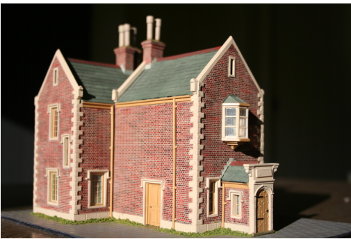
South and West elevations.