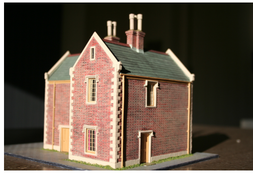
North and East elevations